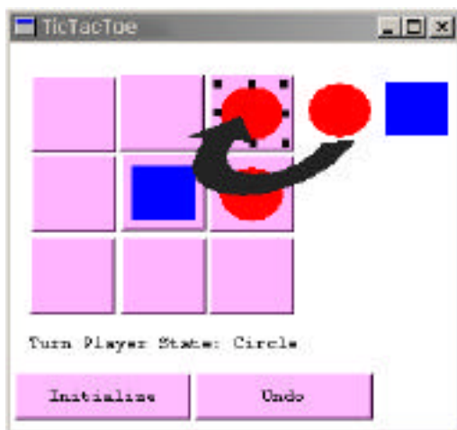
Figure 2. Interface of TicTacToe game

The functional core: in order to illustrate this explanation, let us describe a concrete example on which we can rely. We chose a well-known simple game, the TicTacToe. This game involves two competitors who play in turns. Winning consists in aligning three symbols on a grid. We restrict our domain to an interactive game between two human players. Figure 2 shows a potential interface for the final application.